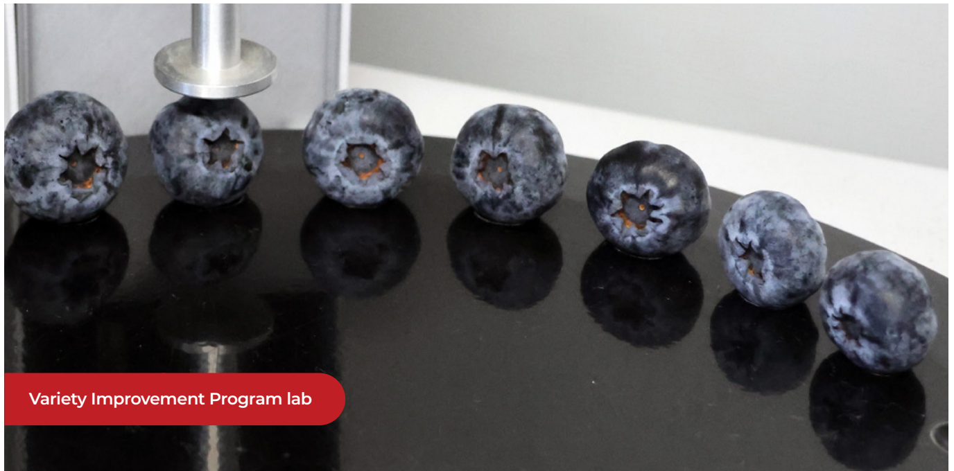
Variety Improvement Program lab

Arana is the key variety grown on the Company farms in Laos and can play a key role in developing Paksong Province's reputation for superior agricultural products and its fruit industry.